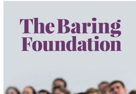
BF Purple logo on a light photographic background