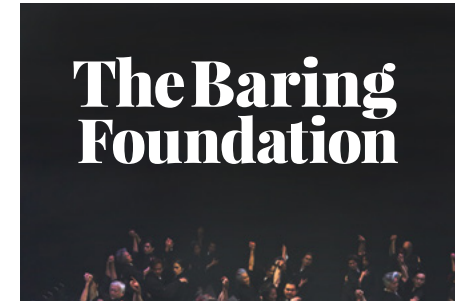
White logo on dark photographic background