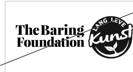
DON'T place partner logos too close