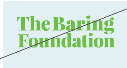
DON'T use a non-brand colour