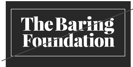
DON'T add anything to the logo