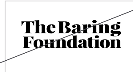
DON'T stretch or distort the logo