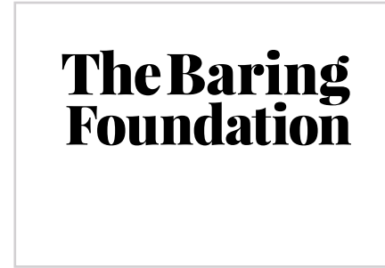
Black mono version on white background