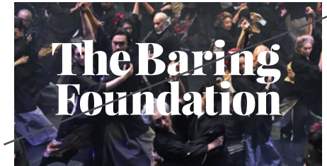
DON'T place on a busy background