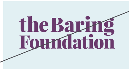
DON'T alter the logo type